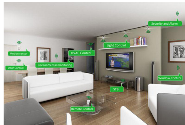
Fig 3.1 Wireless Control

Most of the existing systems are based on android application which requires a connection either by Bluetooth or Wi-Fi. Some of the system requires internet or local area connection to communicate with the home devices to control through voice or button. All these systems work like a remote control which already been discovered and very much cost effective. And few systems are based on weak techniques which are not able to recognize voice correctly especially for Indian speakers. So, we require a system that should be cost effective as well as best at accuracy level.