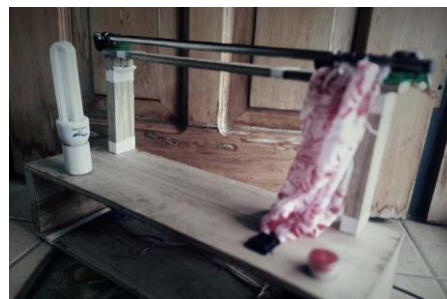
Fig.2.1 System Overview

curtain through voice commands. But Windows Speech Recognition is not yet most popular for voice recognition or it can be stated as the accuracy is not yet effective especially for Indian native speakers due to accent variations [1].