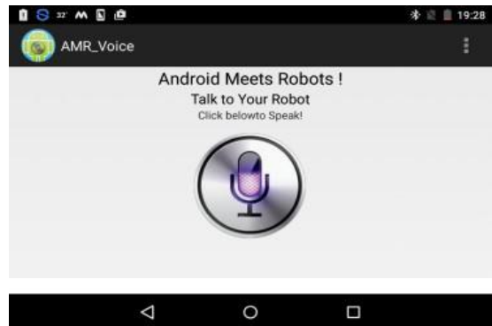
Fig 2.4 Application Interface

is never been effective because Bluetooth has not been considered a strong connection and it is bit slower than other wireless connections [4].