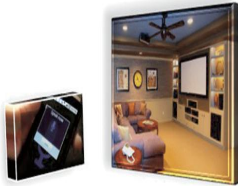
Fig. 2.2 System Overview

The system which has been proposed in this paper is also based on Windows Speech Recognition. An interface has been designed to control light bulbs and fans using Windows Speech Recognition. They stated as it is very helpful for handicapped people to make their life easier. But it has been tested that Windows Speech Recognition is not effective for Indian Native Speakers because of pronunciation or accent. Failure rate is higher for them. That is why it has not been much popular for speech recognition. We need a system that can work for whole world [3].