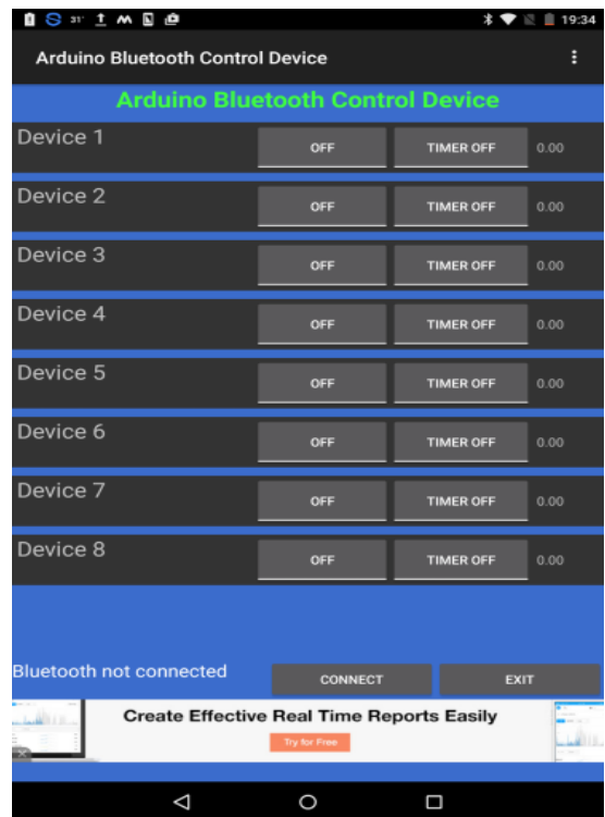
Fig 2.5 Arduino Bluetooth Control Application

The system which has been proposed in this paper is based on Hidden Markov Model (HMM) for voice recognition to control home appliances through voice commands. This Hidden Markov Model is a technique which is generally used in MATLAB for voice recognition on the basis of speech parameters. By the help of Hidden Markov Model we can identify the speaker on the basis of their voice but the failure rate of this technique is high because sometime it accepts every voice command which should not be accepted. In this paper they also produces a connection among all the devices