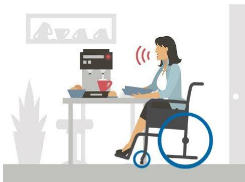
Fig. 1 Voice Control for Disabled

The system of controlling home appliances using voice command or by remote control or smart phone is getting popular day by day and it become enhanced at every level of control. Disable or handicapped people require this kind of system keeping their difficulties on mind. This system helps a lot not only handicapped people but also Veterans (elderly people). We require this system indeed with high level of accuracy.