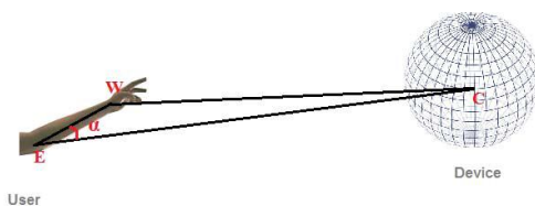
Fig 2.7 Hand Gesture Control

The system which has been introduced in this paper is based on hand gesture recognition control. It means that home appliances like Television, bulb, fan, cooler and many more can be controlled through hand gesture recognition. They uses the method of Kinect and X10 to recognize hand gesture by the help of Depth Sensing cameras. But placing camera with right angle and providing proper gesture from anywhere in a room and especially for disabled or handicapped people is not possible and not convenient as well [6].