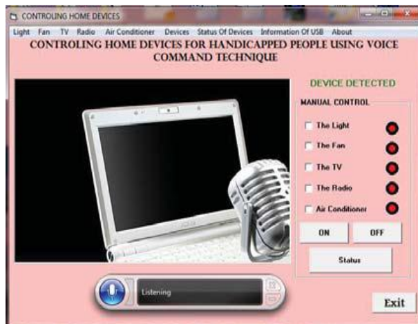
Fig. 2.3 System Interface

The system which has been proposed in this paper is also based on Windows Speech Recognition. An interface has been designed to control light bulbs and fans using Windows Speech Recognition. They stated as it is very helpful for handicapped people to make their life easier. But it has been tested that Windows Speech Recognition is not effective for Indian Native Speakers because of pronunciation or accent. Failure rate is higher for them. That is why it has not been much popular for speech recognition. We need a system that can work for whole world [3].