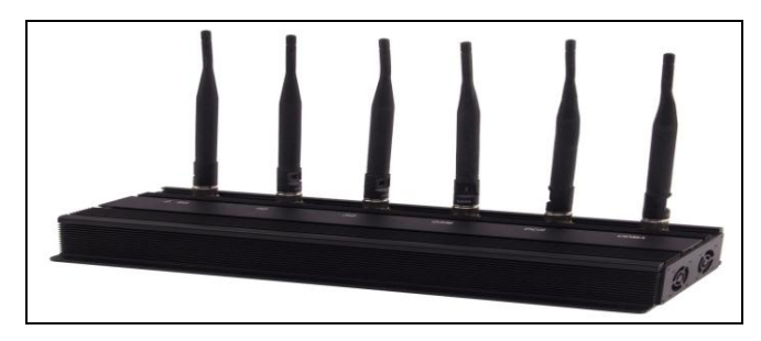
Fig. 3G, 4G Cell Phone Signal Blocker

for pleasant purposes. Factory espionage, exaction - not all criminal activities, it is just a small elements of the activity in which cellular phones are involved. In the 21st century humanity was faced with the issue of unrestricted "flooding" of mobile devices. Conference halls, theatres, etc. are forced to use the phone jammers in those locations where it is required to attain complete silence.