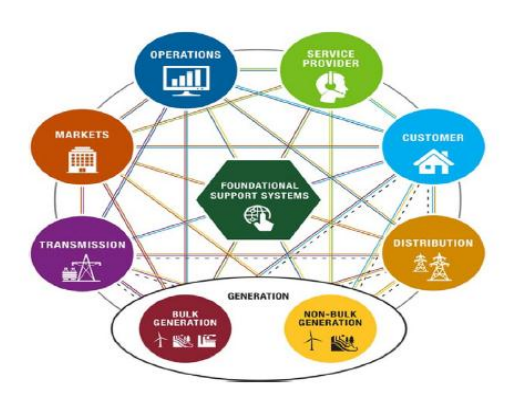
Fig.1 NIST Recommended Model for Smart Grid share the unknown key with the other adversary and based on the analysis of operation determine the key.

On the other hand, in second scenario, the attacker