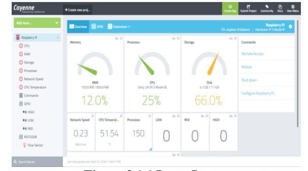
Figure 3.1.1 Input Image

The first input image shows that there is no water input to the dam and so the flow sensor is indicating 0 in the software and the output image shows that the flow of water high into the dam and alert will be send to the concerned personnel.