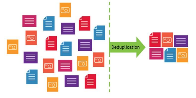
Fig 1: Data deduplication