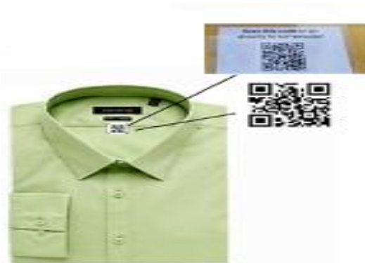
Figure 1. Basic Positioning of NFC tag in a cloth.

A laminated QR-code is impervious to water and dust, pressure is implanted inside the cloths. The QR-code has a special Id written in it by manufacturer. The manufacturer will create a new entry for the Id, fill his side of the table information. The retailer, after selling the product will fill a couple of extra points of interest. In the user side, the QR-code will be scanned by the Mobile Application, then the Id will be read by it. It is cross referenced with the database after that, corresponding details are retrieved.