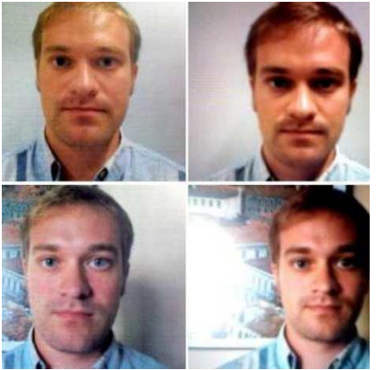
Figure 1: Copy Move attack Example

[13][4]Copy move attack mechanism is also known as cloning. Some part of the image is cut in any size and pasted on some other region in this case. Critical information either is lost or replicated in his case. As the copied part originated from the same image hence determining attack becomes very difficult.