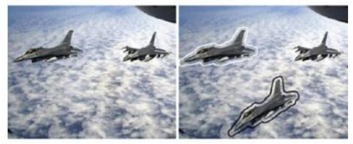
Figure 3: Image Re-Sampling Example

[14]This is another critical method of image attack. In this method some part of the image undergoes transformation. Transformation includes translation, rotation, scaling etc. The transformation used in this case could be uniform or non uniform. Uniform transformation does not alter the shape of the image. The non –uniform transformation on the other hand alter the shape of the image.