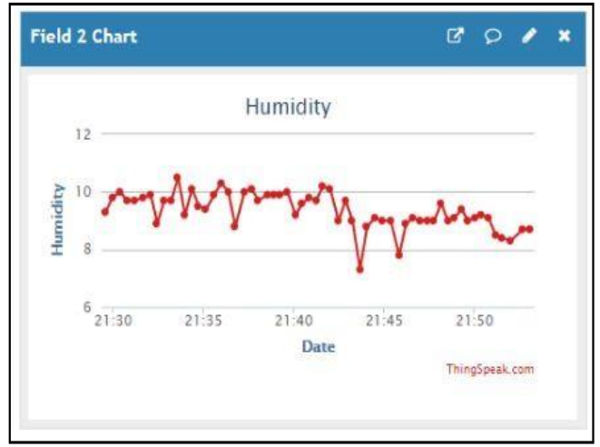
Figure 3 output reading

The web connection point is the association between a client and programming running on a Web server. The UI