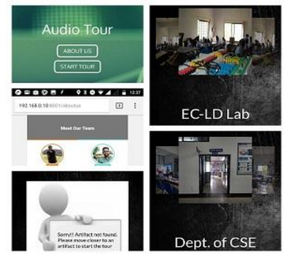
Figure 2. Webpages Rendered

Figure 2 shows the different webpages rendered on the mobile device during the audio tour.