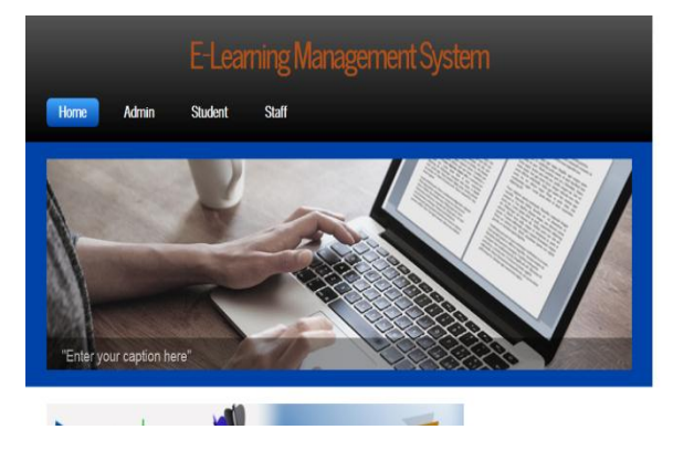
Fig 3: ELMS Main Page