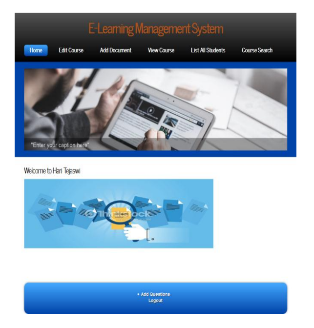
Fig 5: Staff Home Page

• Staff can perform functionalities like Edit Course, Add Document, Add Questions, and View Students. Fig[5]