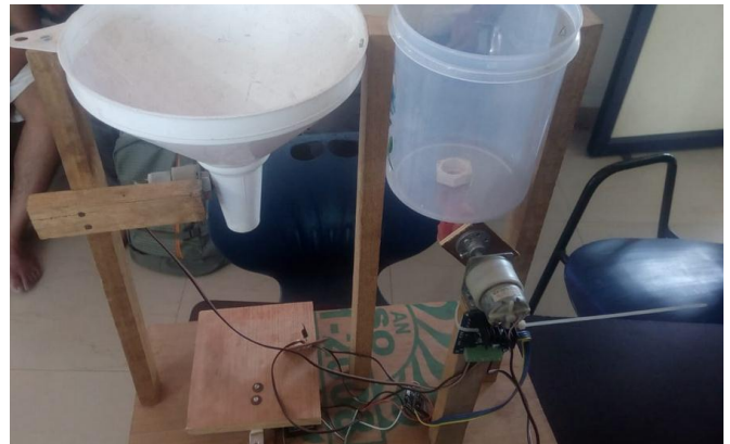
Fig. 2. Hardware Model