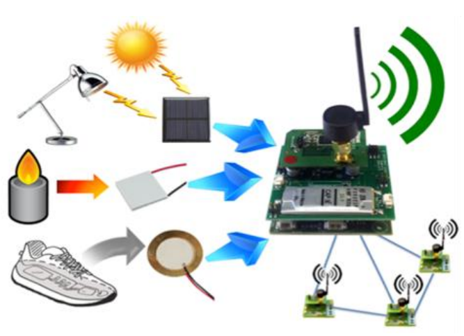
Fig. 2 Mobile Ad hoc Sensor Network

Further, these types of networks are widely called as multihop network because it is based on intermediate hop for data communication. These networks have a wide range of applications in place where an emergency wireless communication has to be established.