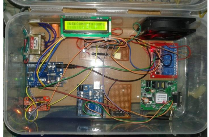
Figure2. Circuit Board

Relays are used basically for control a circuit by a low-power signal (with complete electrical isolation between control and controlled circuits), or where several circuits must be controlled by one signal. In our structure the output from raspberry pi 3 is directly given to a relay circuit. If GPIO pin is high then equivalent relay will turn on and makes it's device state working. We are using a NPN transistor in relay and it works based on concept of EMF(Electromotive Force).