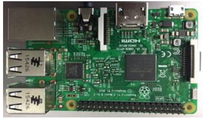
Figure 1: A Raspberry Pi3 Board

The Raspberry Pi 3 board model B has a processor of 1.2 GHz 64-bit quad-core ARMv8 CPU and 1 GB RAM which almost behaves like a tiny computer . Raspberry pi-3 boards have 802.11n wireless LAN and Bluetooth 4.1. We installed Raspbian Jessey in the memory card which is used for the board. Raspberry Pi 3 has a LINUX centred operating system call Raspbian. There are also 40 GPIO pins which can be utilized as both digital input, digital output to control and interface with several other devices in the real world. 1HDMI PORT, 1 ETHERNET PORT, 4 USB ports, 3.5mm Audio jack, micro USB power supply. This board also has serial connections for linking a camera (CSI) and a display (DSI). While maintaining the popular layout the Raspberry Pi 3 Model B brings a more powerful processor, 10x faster than the first generation Raspberry Pi. Additionally, it adds wireless LAN and Bluetooth connectivity causing it to be the ideal solution powerful connected design.