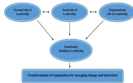
Figure 1: Emotional Intelligence and Leadership Model