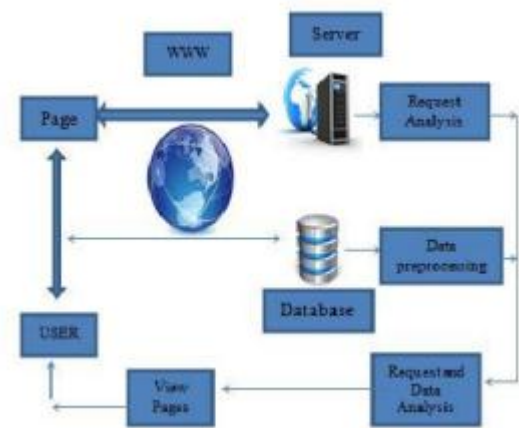
Fig.1 Proposed architecture

This significant characteristic makes this model appropriate for greatly dynamic web sites. Another important dissimilarity is that the model has a strong theoretical basis built upon physical phenomenon. Traditional approaches are general, but this application is based on a state-of-the-art theory of brain choice making. The offer is based on the Markov's Model. The Markov's model simulates the artificial web user's session by estimating the users page Sequences and furthermore by formative the time taken in selecting an action, such as leaving the site or proceeding to another web page. Experiments performed using artificial agents that behave in this way highlight the similarities between artificial results and a real web user mode of behavior. Furthermore, the presentation of the artificial agents is reported to have comparable statistical actions to humans. If the web site semantic does not change, the set of visitors remains the same. This opinion enables the predicting of changes in the access pattern to web pages related to small changes in the web site that protect the semantic. The web user's performance could be predicted by simulation and then services could be optimized.